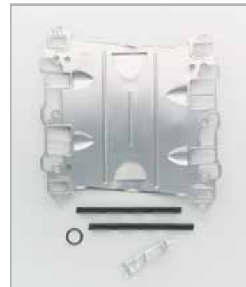
Fel-Pro Intake Valley Pan Set